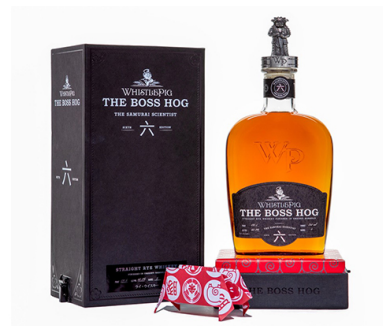
The Samurai Scientist is finished in umeshu-seasoned barrels from Japanese brewery Kitaya