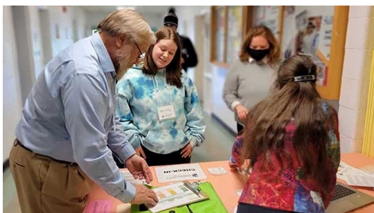
Financial Reality Fair Photo Gallery

The Addison County Workforce Alliance recently held a Financial Reality Fair for young adults to learn about budgeting and lifestyle choices. Thanks to the dozens of volunteers and presenters who provided real world advice and offered services and employment opportunities for the participants. You can see photos and video from the event via the links below.