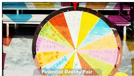
Financial Reality Fair Video